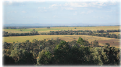
View from Mt Basalt