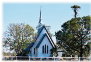
Church of All Saints Yandilla