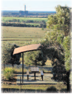
Picnic table and view from Mt Basalt to Power Station