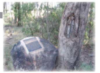
Owens Scrub Tree Plaque